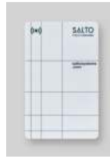
Key Card NXP MIFARE® HID®